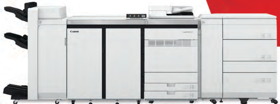
imagePRESS V1000 shown with optional accessories.